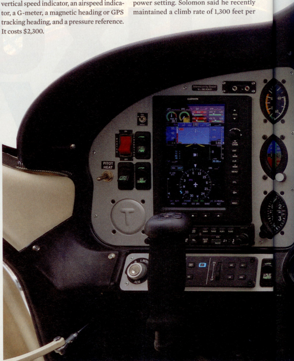
AN LED READING LIGHT (above) and a 12-volt power supply (above center) show attention to detail. The owner opted for a three-screen Garmin G3X system, although one- and two-screen options are available.

Slide the throttle past a detent and a computer will set the engine power to 115 percent, but that setting is limited to five minutes. Still, the engine's computer takes advantage of turbocharging at nearly any power setting. Solomon said he recently maintained a climb rate of 1,300 feet per